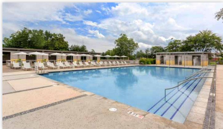
The Mixson Bath and Racquet Club Swimming Pool

For more information, call Aqua Blue Pools at (843) 767-POOL or visit aquabluepools.net .