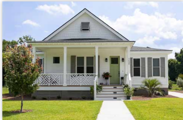
Amerisips Homes' Winning Project